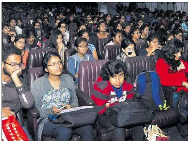
Participants in a workshop on robotics held by IIT Kharagpur students as a curtain-raiser to Kshitij, the annual techno-management fest of the institute, at Vidya Mandir on Sunday. Around 700 students from various engineering colleges in Calcutta took part in the programme. The fest will be held on the Kharagpur campus of the institute from January 27 to 29. All information about Kshitij are available on www.ktij.in.